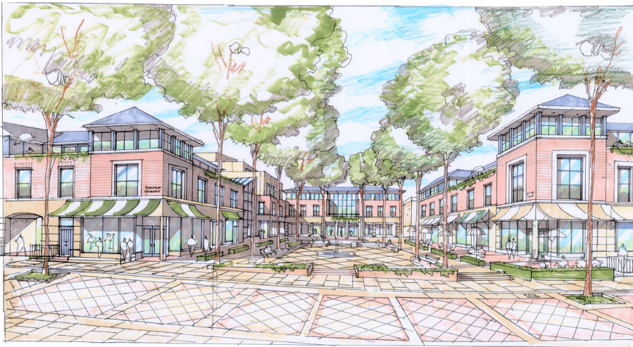
A vision for a Market Square or public plaza viewed from Main Street with the Civic Centre at its heart.

Imagine Dundrum urges local residents, businesses and community groups to support the proposal for a Civic Centre at the heart of Dundrum Village.